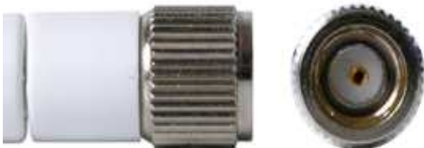
Connector Name : RSMA (SP)