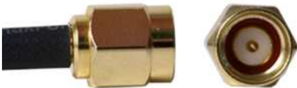
Connector Name : SMA (SP)