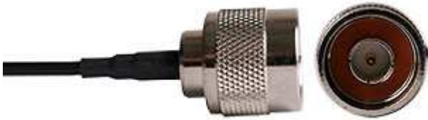
Connector Name : N (SP)