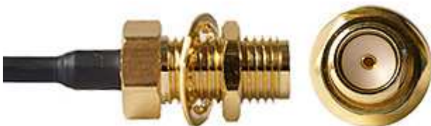
Connector Name : SMA (SBJ)