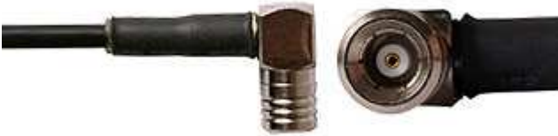
Connector Name : SMB (RAP)