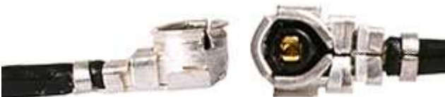
Connector Name : U.FL