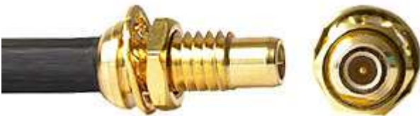
Connector Name : SMC (SBJ)