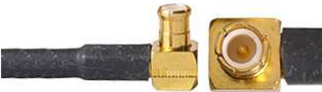
Connector Name : MCX (RAP)