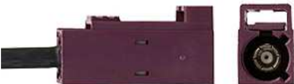
Connector Name : FAKRA (D)