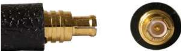
Connector Name : MCX (SP)