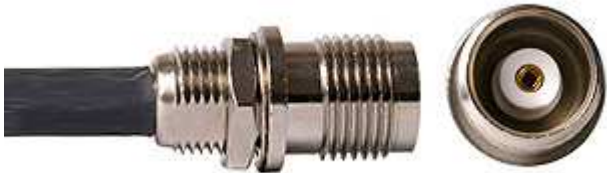
Connector Name : NC Card