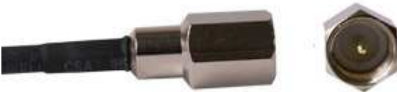
Connector Name : FME (SP)