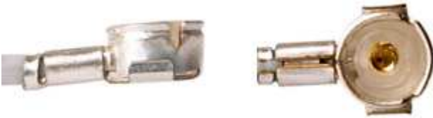
Connector Name : MXTK-92