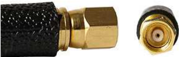
Connector Name : SMC (SP)