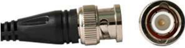
Connector Name : BNC (SP)