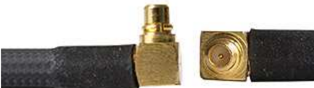
Connector Name : MMCX (RAP)