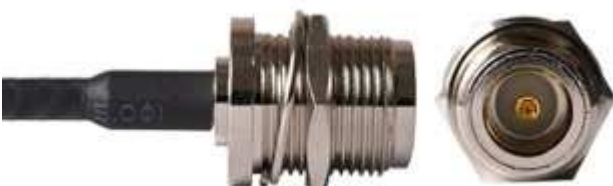
Connector Name : N (SJ)