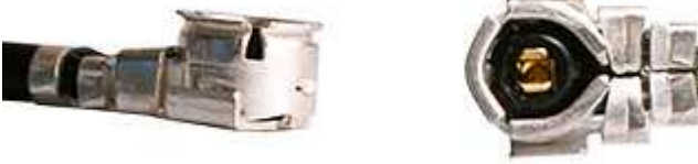
Connector Name : H.FL