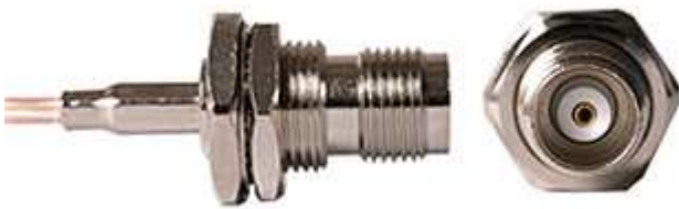
Connector Name : TNC (SJ)