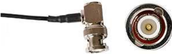
Connector Name : BNC (RAP)