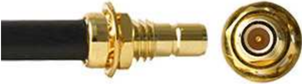
Connector Name : SMB (SBJ)