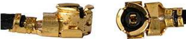
Connector Name : IPEX