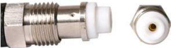
Connector Name : FME (SJ)