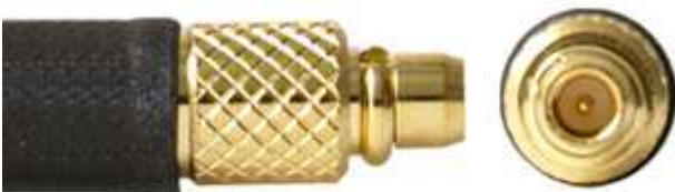
Connector Name : MMCX (SP)